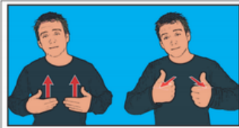
HOW ARE YOU?