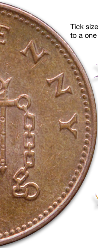
Tick sizes compared to a one penny coin