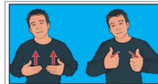
HOW ARE YOU?