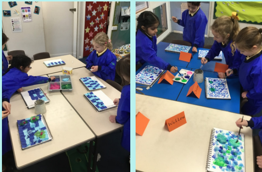
Year 1 Art